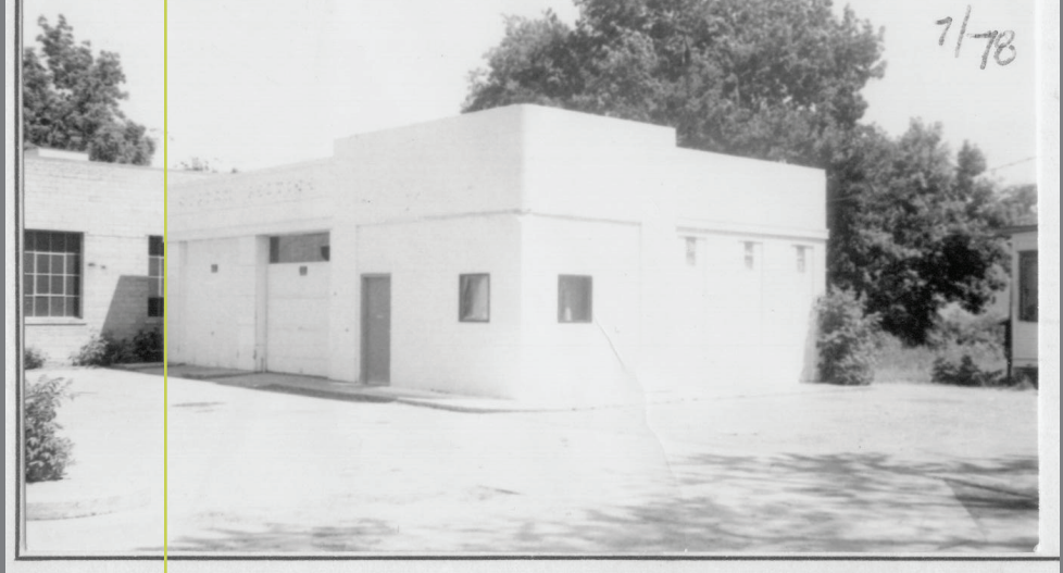
916 WEALTHY STREET